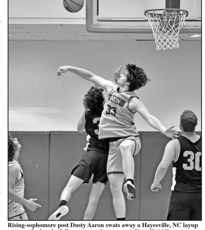
attempt during the full-court practice segment. court practices, they finished the 2-hour practice session with things we need to address. fullcourt scrimmages.